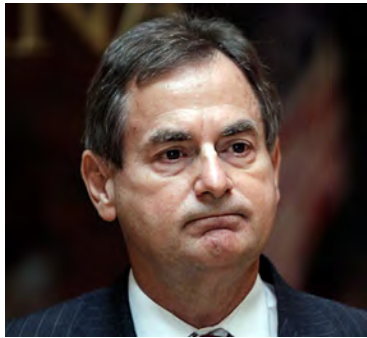
Indiana's Richard Mourdock

The 2012 Indiana Senate race followed a remarkably similar track to Missouri. Pro-choice Joe Donnelly ran head-to-head with staunch pro-life advocate Richard Mourdock. Indiana leaned pro-life, electing pro-life stalwart Mike Pence to the governor's office. Indiana flipped in the presidential election, switching their 2008 Obama vote to solid support for Romney (54 to 44 percent).