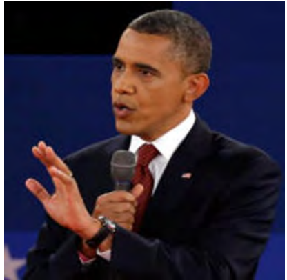
Obama doubled-down on abortion in 2012

In the wake of that election, we found that former presuppositions and assumptions did not hold true. Contrary to our beliefs and the polling data, the increasingly “pro-life” electorate, did not translate their “pro-life” identification into concurrent votes for pro-life candidates, legislation, and amendments. They voted instead against the true pro-life position and are still doing so today.