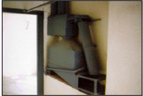
This unit dispensed Zyklon B into the Dauchau gas chambers where unsuspecting victims awaited.

The company collaborated closely with the Nazis during the invasions of Czechoslovakia and Poland, directing which factories should be seized and placed under IG Farben's control. They opened a factory at the infamous Auschwitz concentration camp where the internees were used as slave labor to manufacture synthetic oil and rubber for the Nazi war effort.