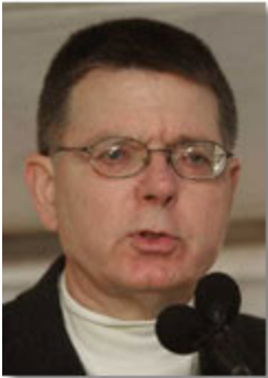
Late-term abortionist George R. Tiller

abortion collaborators. Those who participate in and/or profit from the murder of innocent children must not be allowed to hide their guilt.