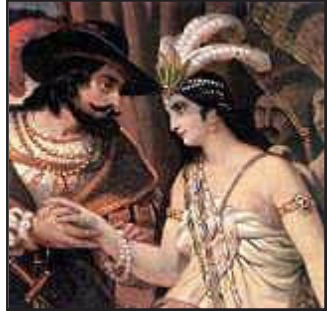
Cortez and Doña Marina

Doña Marina was an Aztec slave woman reviled for her betrayal of her people to Hernando Cortez, the Spanish Conquistador who nearly exterminated the Aztecs.