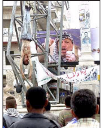
Masked Palestinian gunmen killed this man and seven others for collaborating with Israel in January of 2002.