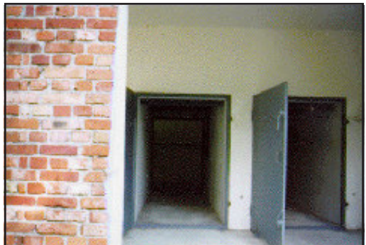
Two of the gas chambers at Dauchau where IG Farben's Zyklon B gas killed hundreds of people.

Not all collaborators have been individuals. Perhaps the most notorious example of a business collaborator is IG Farben, a chemical company that collaborated with