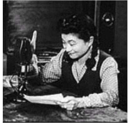
Ikuko Toguri, as Tokyo Rose

Ikuko Toguri was a Japanese woman born in Los Angeles in 1916. She was in Japan when WWII broke out and was soon hired by the Japanese for psychological warfare over the radio waves. The Japanese used Toguri's radio show, where she identified herself as "Orphan Ann," in attempts to demoralize the Americans fighting in the Pacific Theater. The name "Tokyo Rose" was the nickname given to her by American seamen. After the war, Toguri was tried for treason in San Francisco, California. The court rejected her defense that she was forced to broadcast Japanese propaganda and Toguri was sentenced to ten years in prison. In 1977, in a rare act of mercy, President Gerald Ford granted a presidential pardon to the infamous Japanese collaborator.