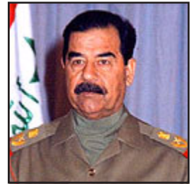
Collaborators with Saddam Hussein in the murder of innocent Kurds are being sought today.

Although Americans discovered records that implicate Baathist collaborators in heinous crimes, to the dismay of the Kurdish people, those lists have not been made public.