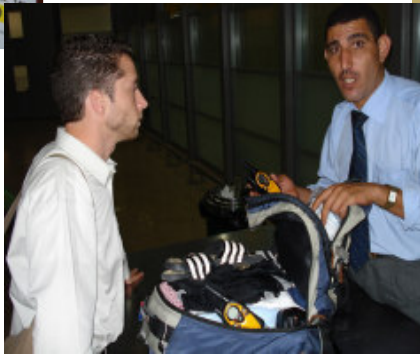
Searches every 10 minutes in a warzone!