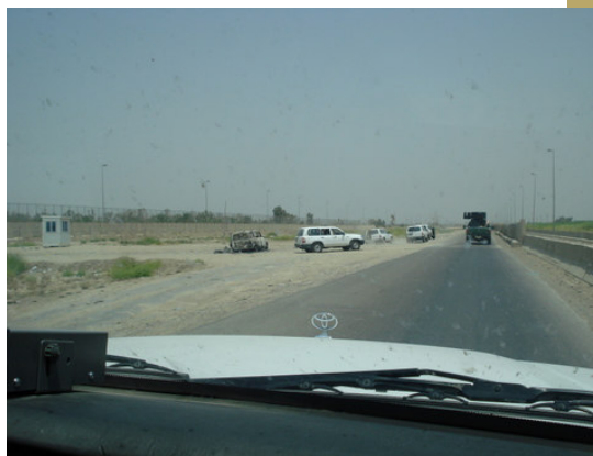
Deadly Force Authorized in this Area!