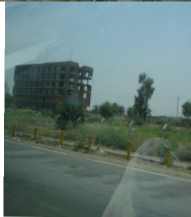
Former Baathist headquarters bombed out by America, yet reconstruction continues everywhere! Pray for the peace of Iraq, no child should live in a warzone!