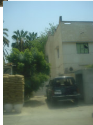
Every home is a bunker!