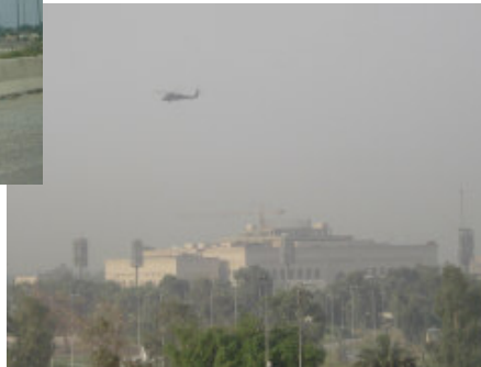
The USA maintains air superiority