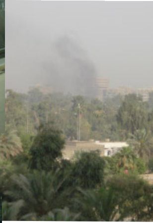
This bomb exploded outside the green zone